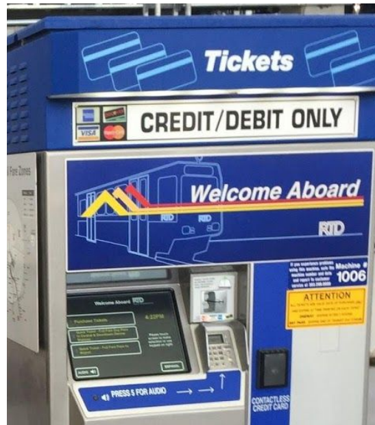
Ticket vending machine on platform

Once you have arrived at 1201 Larimer St, proceed to the 4th Floor for the workshop